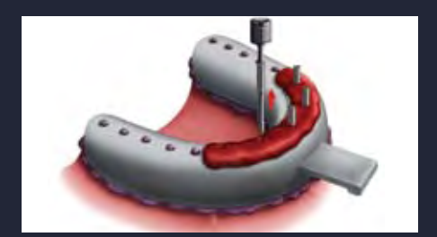
STEP 4: Once the impression sets, remove each guide pin. Ensure all guide pins are completely disengaged before removing from patient's mouth.