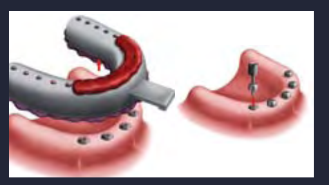
STEP 5: To avoid soft tissue collapse on the implant, immediately replace healing abutments on all implants before continuing.