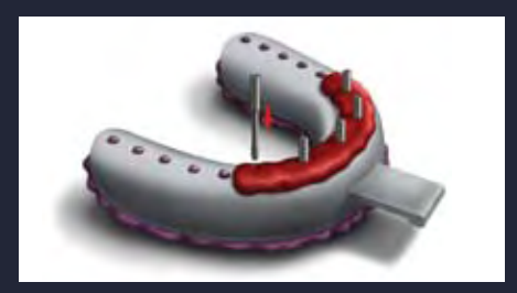
STEP 6: Place the guide pins into the impression and send the case to Glidewell Laboratories.